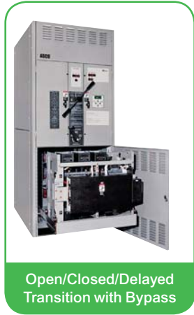
Open/Closed/Delayed Transition with Bypass

7000/300 Series Power Transfer Switches are available in open and enclosed variants, ranging from 30 to 4000 amps (LV) & 1200 to 3000A (MV) with wide range of accessories. All switching configurations (OTTS, DTTTS, CTTS) are available with optional integrated bypass-isolation switch.