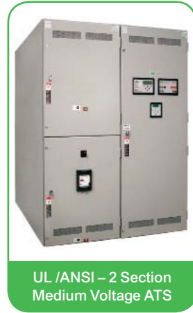
UL /ANSI – 2 Section Medium Voltage ATS