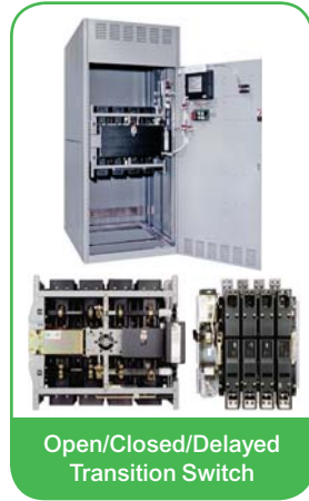
Open/Closed/Delayed Transition Switch