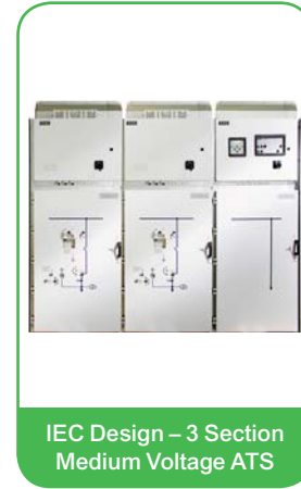
IEC Design – 3 Section Medium Voltage ATS